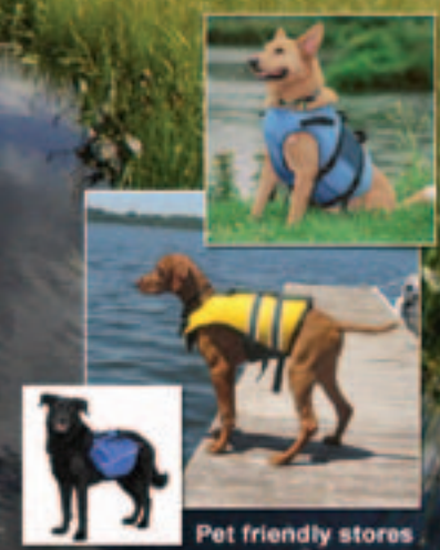
Pet friendly stores

Canoe Trip Reservations: 1-800-469-4948 Huntsville retail store 705-787-0262 www.algonquinoutfitters.com